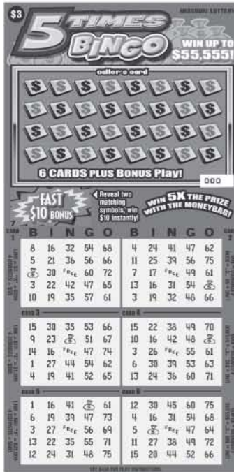
Game 835 ($3) "5 Times Bingo"