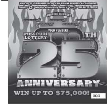
Game 834 ($5) "American Muscle™"