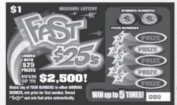
Game 837 ($1) "Fast $25's"