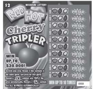
Game 836 ($2) "Red Hot Cherry Tripler"